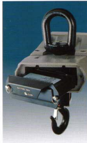
► Battery Pack Installation