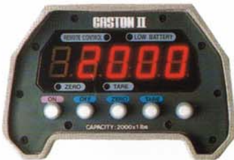
▲ Display & Keyboard