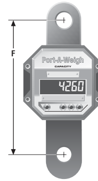
FRONT VIEW (50/70/100,000 lb. Models)

Note: Unit comes standard with top shackle and bottom swivel hook.