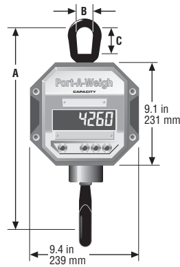
FRONT VIEW (500 - 30,000 lb. Models)

***** Ultimate overload: 450% of kg capacity